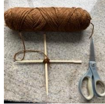
Place the chopsticks into a "t" shape. Tie it together with string or yarn.