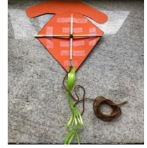
Secure the yarn or string to the back of the kite.

Materials: paper, chopsticks, string or yarn, tape, glue, scissors, various art medium