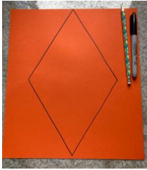
Draw a diamond

Lupe (Kites) were used throughout Polynesia to propel rafts, transport goods, and to perpetuate stories. Traditionally made with kapa or lauhala, they were most popularly used to determine wind direction and for play. Decorate a paper lupe (kite) with various art medium. There are no creative or imaginary limits!