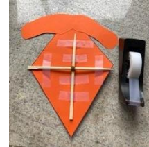
Tape the chopstick to the undecorated side of the kite.